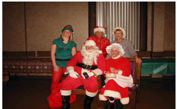
Santa and his crew at the Lodge.