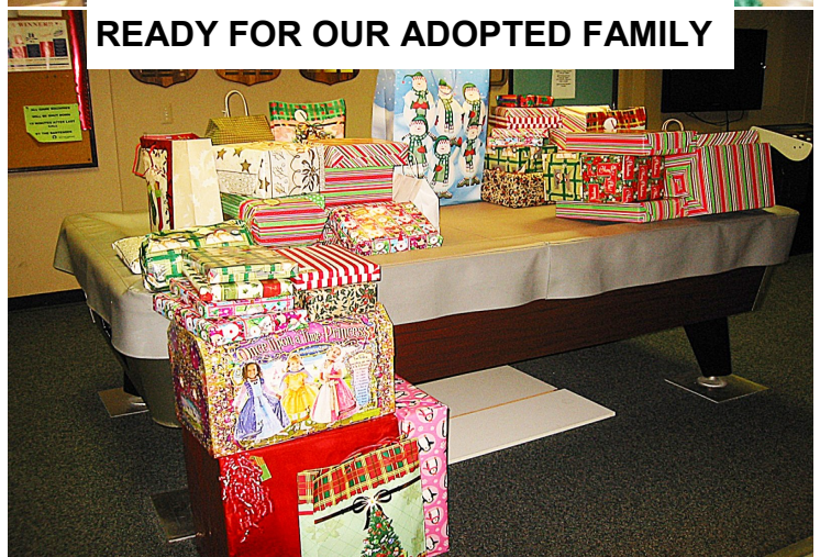
READY FOR OUR ADOPTED FAMILY