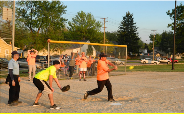
How bout those Tigers! No, that's a mistake, that's the Royal Oak Elks Softball team hitting em away. See more on the photo page 5