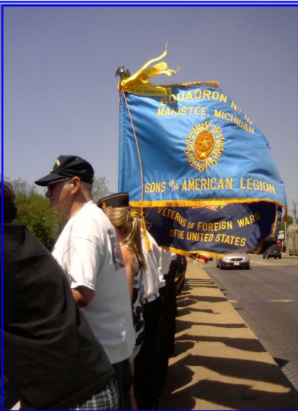
Vets at Tighlines