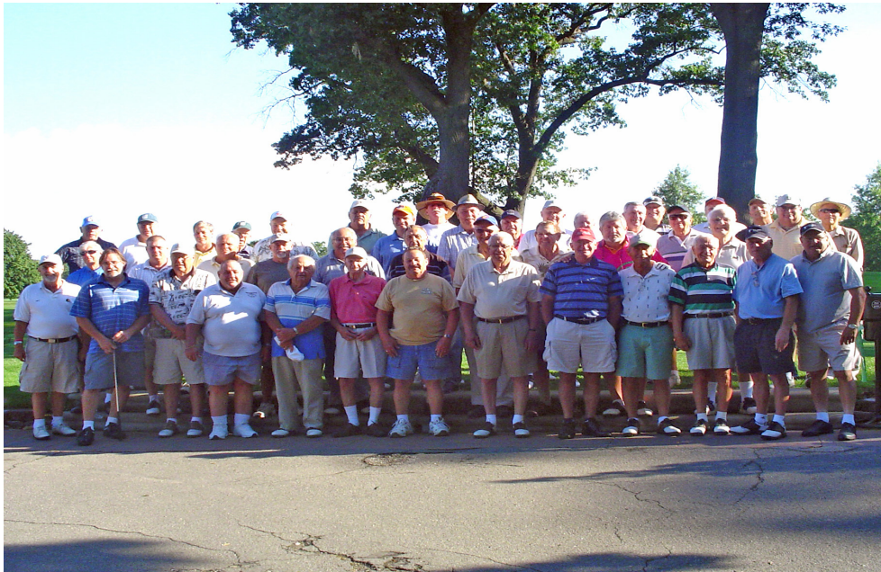
Wednesday, Scramble Golf League Royal Oak Elks Lodge 1523